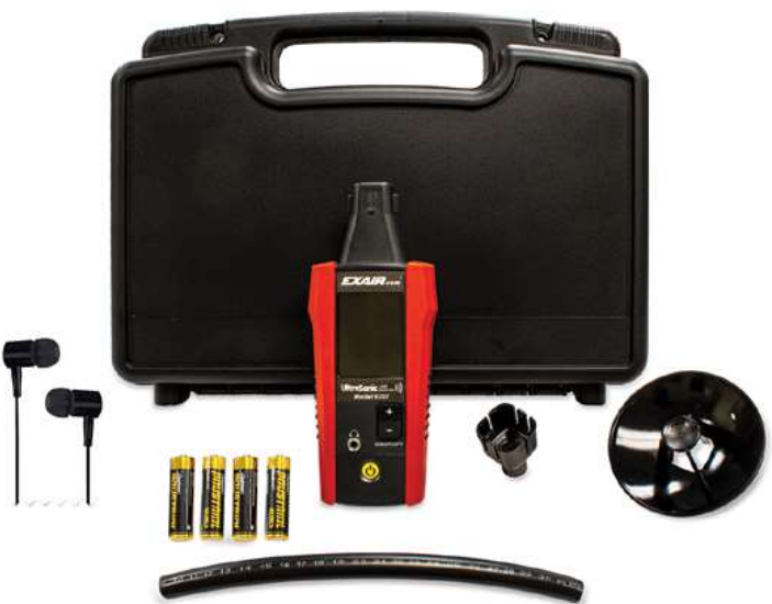
The Model 9207 Ultrasonic Leak Detector comes complete with a hard-shell plastic case, earbuds, parabola, tubular adaptor, tubular extension and 4 AA batteries.